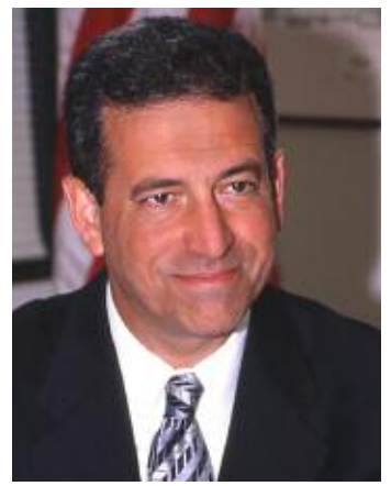
U.S. Senator Russ Feingold

yard signs, political buttons, and designed and produced campaign literature for volunteers to take door-to-door. Tenth Dems also provided financial support for nearly three dozen candidates in 2004 and 2005 elections, donating over $20,000 to their campaign efforts. And this is just a partial list of what Tenth Dems has done.