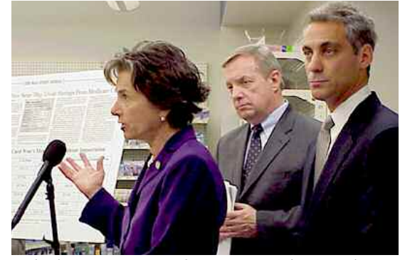
Illinois Democrats Jan Schakowsky, Dick Durbin and Rahm Emanuel will all play prominent roles in the new Congress.

So the sweetness of victory tasted by other Democrats across this finally-fed-up country of