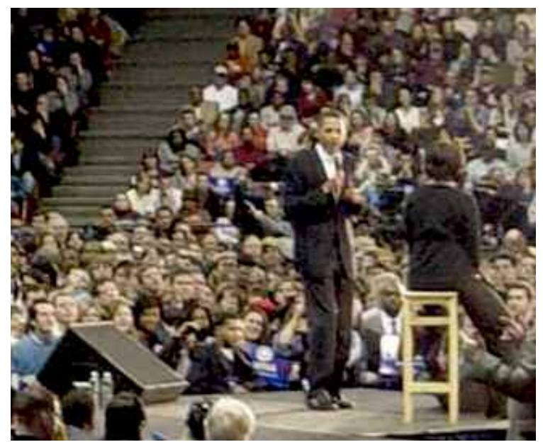
Obama addresses the enthusiastic crowd at the UIC rally.

are in complete agreement about this one.