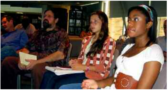
Participants in freewheeling political discourse pay respectful attention during a Let's Talk Politics session in Northbrook.

If you answer yes to any of these questions, then you may want to attend a "Let's Talk Politics" (LTP) square-shaped roundtable discussion. These freewheeling political