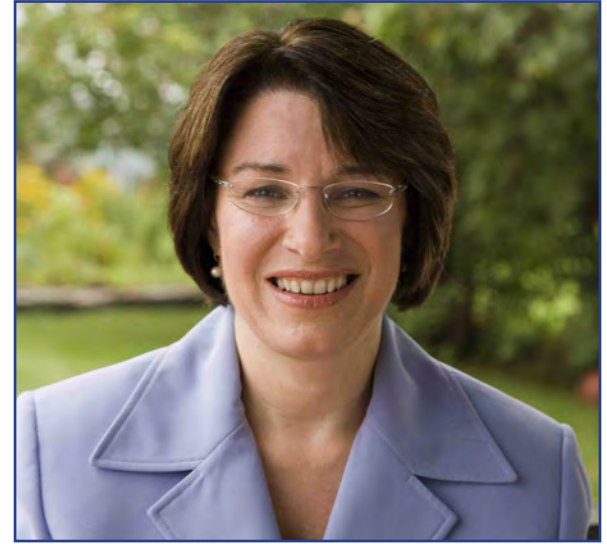
continued on page 10

Who is Senator Amy Klobuchar? The Washington Post has described U.S. Senator Amy Klobuchar as a “rising star,” and The New York Times included her in a list of the 17 women most likely to become the first female President of the United States. Serving in Minnesota’s Senate delegation with fellow Democratic Senator Al Franken, she is widely noted for her exceptional work in bringing innovative agendas to Congress. This is not an event you want to miss!